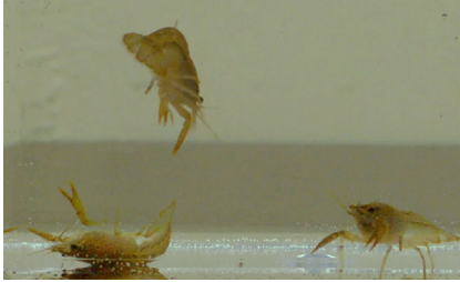
Inebriated crayfish.