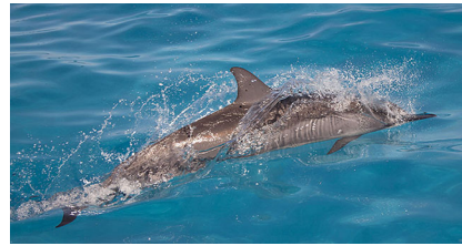
Spinner dolphins.

Just because dolphins are born in water doesn't necessarily mean that their in-built SCUBA system is fully prepared for action at birth; it can take between 1 and 3 years for the oxygen carrying capacity of whales and dolphins to mature sufficiently. Shawn Noren, from the University of California, Santa Cruz, USA, explains that the muscles of fully developed diving species – including dolphins, whales, birds and seals – contain more of the oxygen carrying protein, myoglobin, than land-based animals and are better prepared to neutralise lactic acid produced in the muscles when divers switch to anaerobic respiration after exhausting their oxygen toward the end of a dive. 'We wondered if pelagic (offshore) living promotes rapid postnatal maturation of muscle biochemistry', says Noren. In other words, might deep-diving ocean-going whales and dolphins develop large reserves of myoglobin and the ability to buffer muscle against acid earlier in life than species that remain in shallow coastal waters?