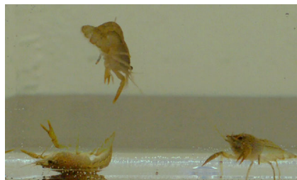
Inebriated crayfish.