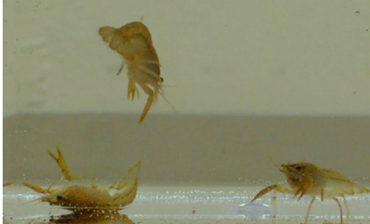
Inebriated crayfish.