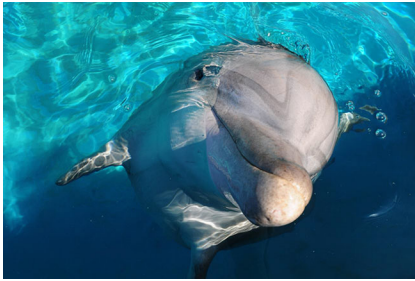
A dolphin that participated in the study.

Surviving in an environment that actively impedes your progress can leave you vulnerable during an escape; couple this with the need to conserve limited oxygen reserves and the magnitude of the challenges faced by many cetaceans when threatened becomes clear. ‘Amazingly, there has been only a handful of studies that have actually measured the energetic cost of a dive for dolphins or whales’, says Terrie Williams, from the University of California Santa Cruz, USA, who is fascinated by how marine mammals balance their energy demands with their finite oxygen supply. Explaining that fleeing dolphins beat their fins continually when swimming full-out, while adopting a more leisurely burst-and-glide style during a routine dive, Williams wondered just how much energy each swimming style uses and how much energy a startled animal may use when evading peril.