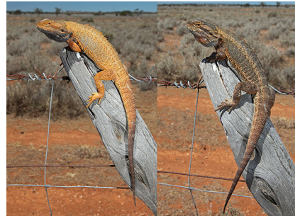
A bearded dragon before and after changing colour.

Blushing and suntanning (or sunburning) are probably the best we can hope for on a spectrum of natural skin tone change; but imagine having access to a whole palette of colours that you could change at will. While chameleons are best known for their pyrotechnic colour displays, dowdier bearded dragons ( Pogona vitticeps ) are also capable of switching between muted shades in a matter of seconds. 'There are three main potential benefits to colour change', says Viviana Cadena, from the University of Melbourne, Australia, explaining that bearded dragons probably change colour to regulate their body temperature; to communicate with the opposition while defending territory and during courtship; and to blend in with the surroundings for camouflage. But Cadena and her colleagues Kathleen Smith, Devi Stuart-Fox and John Endler wanted to understand how bearded dragons alter their colour when the shade of their surroundings changes and when the light intensity alters as a cloud passes over.