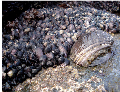
An adult Concholepas concholepas in mussel beds on the Chilean shore.