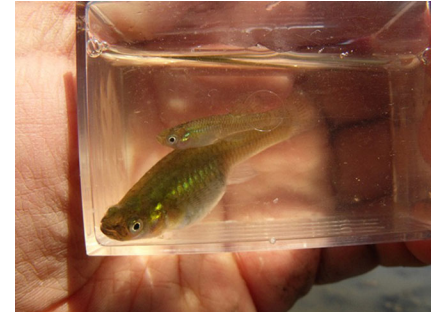
Mosquitofish ( Gambusia holbrooki ) female and male.

From human couch potatoes to captive salmon and even our pets, adopting an active lifestyle can extend life expectancy and improve health. Releasing protective compounds (antioxidants) and enzymes into our bodies that protect against the ill effects of the toxins (reactive oxygen species) that are naturally produced by metabolism, exercise can even reduce the incidence of cancer and the effects of ageing. Knowing this, Frank Seebacher (University of Sydney, Australia) and Craig Franklin (University of Queensland, Australia) wondered whether exercise may also protect animals from the damage caused by a dose of sun. Seebacher explains that exposure to UV-B, one of the wavelengths that causes sunburn, also produces the reactive oxygen by-products that are so damaging to our tissues. So could exercise protect animals from the harmful effects of sun exposure too?