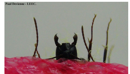
A harnessed ant with open mandibles.