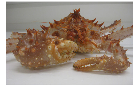
Lithodes maja, a member of the king crab family.