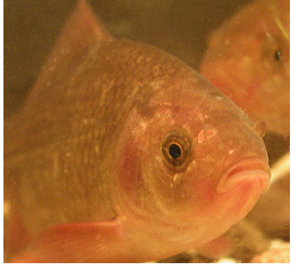
Crucian carp.