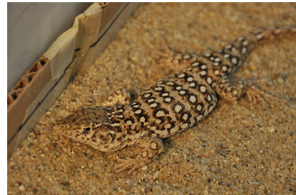
A steppe-runner lizard on a coarse sand runway.