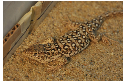
A steppe-runner lizard on a coarse sand runway.