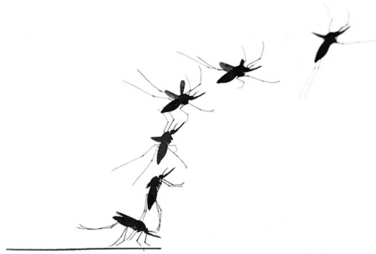
Photomontage of a blood-fed mosquito taking off.

Stealth and haste are often at the heart of most successful raids, and the forays of famished female mosquitoes are no different. ‘Female mosquitoes need a blood meal to develop their eggs’, explains Florian Muijres, from Wageningen University, The Netherlands, adding that zipping in and out after a quick sip without attracting the attention of the unfortunate victim is essential if the insect is to survive. ‘One critical manoeuvre is the escape take-off after blood-feeding’, says Muijres. The fully loaded insect should push off quickly from the surface of its victim to get away swiftly, but a softer and gentler take-off would be less likely to arouse the attention of a disgruntled host. Knowing that humans are particularly vulnerable to mosquito bites, which can transmit deadly disease, Muijres, Jeroen Spitzen (Wageningen University) and Sofia Chang (University of California, Berkeley, USA) scrutinised the voracious insect’s escape technique to find out how it manages to evade scrutiny when fully laden.