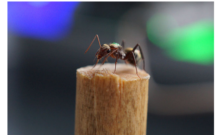
An ant that has been selected for training.