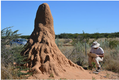
A Macrotermes michaelseni termite mound.