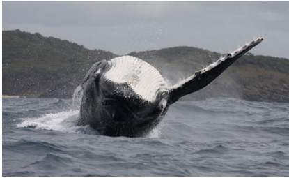
A humpback whale breaching.