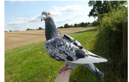
A homing pigeon carrying a GPS sensor and an accelerometer to detect motion.