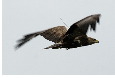
Lesser spotted eagle flying with GPS transmitter.

Although the lesser spotted eagle is not listed as endangered by the IUCN, Bernd-Ulrich Meyburg from BirdLife Germany (NABU) knows that the graceful bird of prey's future is far from assured in Germany. Meyburg explains that the German population has dwindled to just 110 breeding pairs in recent decades, largely due to habitat loss and persecution by poachers during their long migration to their overwintering sites in southern Africa. In a bid to stem the destruction of the German population, Meyburg has been relocating chicks from the more stable Latvian population in the hope of boosting the declining German numbers. However, it was not clear whether the translocated chicks would survive the gruelling migration to their overwintering sites in southern Africa. To be convinced that the conservation strategy might offer hope for the German population, Meyburg needed evidence that the translocated Latvian chicks could somehow reach South Africa and return successfully.