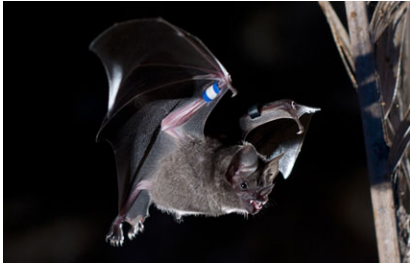
Seba's short-tailed bat.