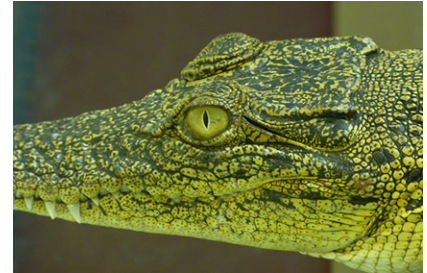
Juvenile saltwater crocodile.

Crocodiles and alligators have perched at the water's edge waiting for the perfect dining opportunity to pass for millions of years. Explaining how the animals also spend much of their time immersed in water with only their eyes and nostrils protruding above the surface, Nicolas Nagloo from The University of Western Australia adds that this posture provides them with a unique perspective on the world. 'The water surface makes up the majority of the bottom of the visual field and the visual horizon occurs along the riverbanks where the crocodile sees best', he says. However, while the visual worlds of saltwater and freshwater crocodiles are essentially identical above the water's surface, the light conditions are significantly different when the animals are submerged: 'In freshwater habitats, there is an abundance of long wavelength [red] light... In contrast, saltwater habitats transmit a broader range of wavelengths, providing a greater amount of short wavelength [blue] light', Nagloo explains. Knowing that crocodiles cannot see clearly when submerged but they have a fantastic assortment of adaptations that help them to see and hunt in dim conditions, Nagloo and his colleagues Shaun Collin, Jan Hemmi and Nathan Hart decided to gaze into the eyes of two Australian crocodile species to