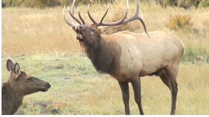
A bugling wapiti.