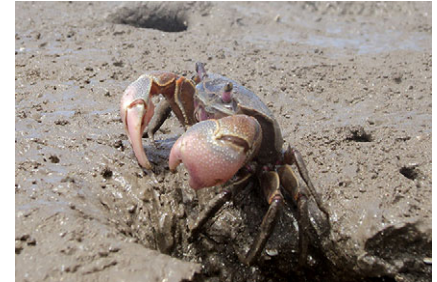
Neohelice granulata from the population that experienced predation.