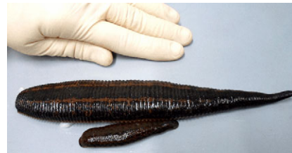
A fed and an unfed leech.

If your next meal could be as much as a year off, the pressure is on whenever a tasty snack shambles past. Medicinal leeches ( Hirudo verbana ) only have one shot to pump their victims full of anticoagulant and anti-inflammatory saliva to ensure that their host is none the wiser as the blood is drained from them. Having satisfied their hunger, leeches then have to prepare for whenever the next meal may pass their way by recharging their salivary glands with the proteins that are essential for when they feed. However, it was not clear whether leeches refilled their salivary gland cells straight after finishing sucking on their victim or waited until they had finished digesting the meal. Jan-Peter Hildebrandt, from the Ernst Moritz Arndt University, Germany, explains that the first alternative would leave the leeches better prepared to grasp any opportunities that brushed past, at the expense of maintaining the fully charged salivary glands, whereas recharging the