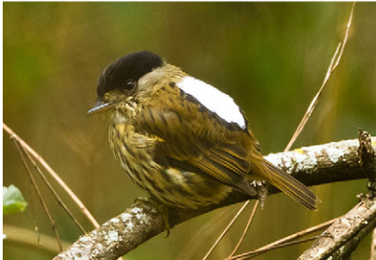
An adult male African broadbill at the Ngorongoro Crater, Tanzania.