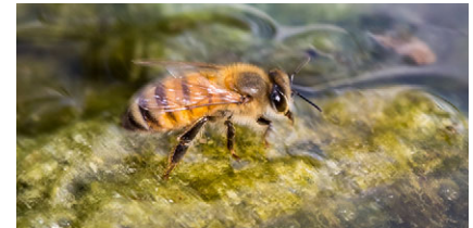
A honeybee drinking water.

The agricultural belt of the USA is in the midst of an environmental disaster. Populations of honeybees ( Apis mellifera ) that pollinate food crops in the USA and Europe are being decimated and there is no clear single culprit. Until recently, parasites, pesticides and climate change were thought to be the contributors to the insects' demise, but now another factor is becoming apparent: malnutrition. 'Most of the research focuses on adult bee nutrition', says Ying Wang from Arizona State University, USA. However, little was known about the effects that malnutrition in early life could have on the adults. Starvation early in life is often detrimental, but it can prepare non-social animals, such as other insects, birds and mammals, for occasions when food is scarce when older. However, social bee larvae rarely experience starvation; they are usually reared in a stable environment with a reliable food supply. Could honeybees capitalise on the experience of shortages as larvae to prepare for times of scarcity when adults?