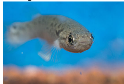
A mangrove rivulus fish.

For most species, reproduction is simple: boy meets girl and the rest is history. But mangrove rivulus ( Kryptolebias marmoratus ) cut directly to the chase: 'This fish has the unique ability of "selfing" [where the fish reproduce sexually with themselves]', says Mark Garcia from the University of Alabama, USA. The majority of the fish in rivulus populations are hermaphrodite – maintaining both male and female reproductive tissues in a single ovotestis – with only a small percentage of males making up the numbers. But, this fish also has another talent. When the temperature rises, they can change sex from hermaphrodite to male and do away with their ovarian tissue – although they only embark on this radical alternative when the costs of maintaining a hermaphrodite lifestyle exceed those of being male. So far, the only factor that is known to trigger the fish's transition is high temperature. 'We were interested in understanding the differences between the sexes so that we can better predict the point at which it