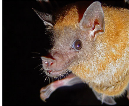
Leptonycteris yerbabuena on Don Panchito Island, Mexico.