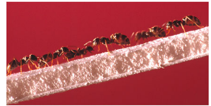
Black garden ants ( Lasius niger) on a cotton bridge.