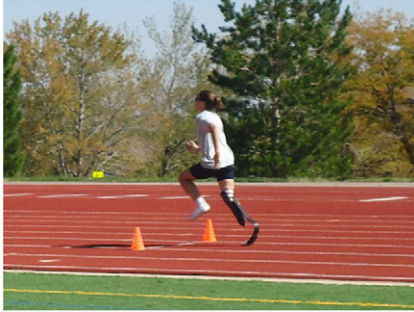
A Paralympic sprinter.