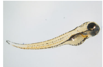
A zebrafish larva.

Few animals are born fully equipped to deal with the world. Most continue developing after birth, and for a zebrafish larva, one of the key structures that is thought to undergo massive changes during the earliest weeks of life is the lateral line system. ‘The lateral line is how fish sense water flow’, explains Matt McHenry, from the University of California Irvine, USA, who adds that the sensory system may allow peckish larvae to detect swirls in the water produced by juicy water fleas sweeping past. ‘If you have the ability to feed in the dark or in dim, turbid conditions... then you have a great advantage’, says McHenry. Wondering if the ability of zebrafish larvae to forage in the dark improved as their flow-sensitive lateral line system developed, McHenry and graduate student Andres Carrillo began testing how zebrafish youngsters coped with catching live meals when the lights went out.