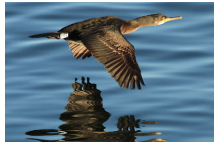
Shag in flight.