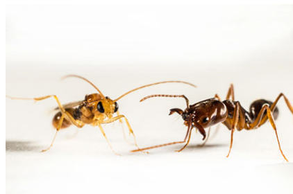
A male (left) and a worker (right) Odontomachus ruginodis ant.