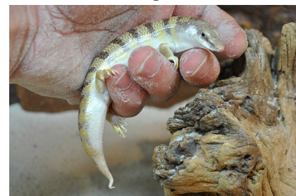
Sandfish lizards ( Scincus scincus ).

Creatures that make their homes in the desert have to be tough and adaptable. To overcome the searing heat and lack of water, many have developed strategies that help them to avoid the sun at critical times. Sandfish lizards ( Scincus scincus ) from the North African desert resolve the challenge by plunging beneath the surface of the dunes and burrowing down into sand at a comfortable temperature. Yet how these reptiles breathe in an environment where most would suffocate was a mystery. Not only must they breathe in sufficient oxygen while entombed in sand, but they must also avoid inhaling grains into their delicate lungs. According to Anna Stadler, from Johannes Kepler University Linz, Austria, another burrowing species – the Colorado Desert fringe-toed lizard ( Uma notata ) – is equipped with a U-shaped kink in its respiratory tract, which traps sand particles that are then exhaled. Might subterranean sandfish use a similar twist to keep their lungs sand-free?