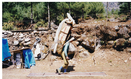
A Nepalese porter carrying a typical load.