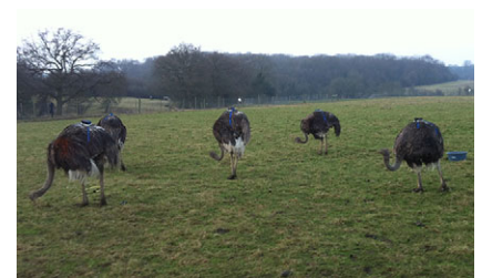
Ostriches wearing tracker backpacks.