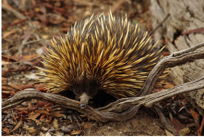
A short-beaked echidna.