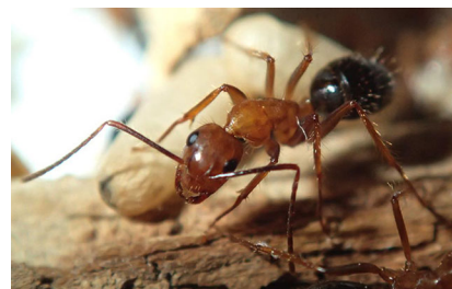
Campanotus floridanus.