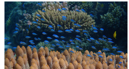
Chromis viridis on the Great Barrier Reef, Australia.