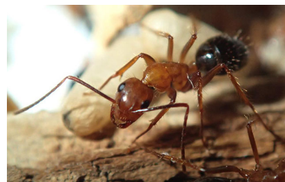
Camponotus floridanus.