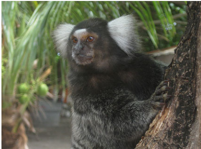
A marmoset on Itamaracá island, Pernambuco, Brazil: Photo credit: Cynthia Thompson.

The spectacle of a tightrope walker apparently suspended in mid-air on a thread-like cable has mesmerised crowds for generations, from Charles Blondin's first crossing of the Niagara Gorge in 1859 to Philippe Petit's 1974 death-defying 'coup' traversing a 61 m-long cable, 400 m above the ground between the twin towers of the World Trade Center. Yet awe-inspiring aerial displays are routine for many tree-dwelling species. 'The ease with which primates can walk and run over narrow and compliant branches has long fascinated both scientists and the public', says Jesse Young from Northeast Ohio Medical University, USA, who has spent the last 5 years investigating how tree-dwelling species negotiate their complex surroundings. 'We've amassed a large dataset on how primates adapt their walking and running patterns to cope with variation in perch diameter', he says. Yet, little was known about how primates tackle the challenge of bounding along a springy tree limb. Intrigued by this knowledge gap, Young and Brad Chadwell decided to investigate how marmosets take pliable surfaces in their stride.