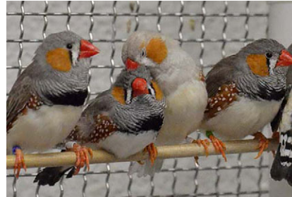
Zebra finches performing social grooming.

Some mums have a long way to go before they can lay eggs, from the Arctic terns that voyage north from Antarctica, to the enigmatic swallows that migrate to Europe from Africa each year. But what impact do these extreme exertions and the diets that these birds consume have on the quality of the eggs that they lay upon their arrival? 'Physiological challenges during one part of the annual cycle can carry over and affect performance at a subsequent phase', say Megan Skrip and colleagues from the University of Rhode Island, USA. However, investigating the direct impact of these factors in migrating species would be an almost impossible task, so Skrip and Scott McWilliams turned to a more sedentary and well-understood species – the zebra finch – to discover how diet and migration affect how females allocate nutrients to their eggs.