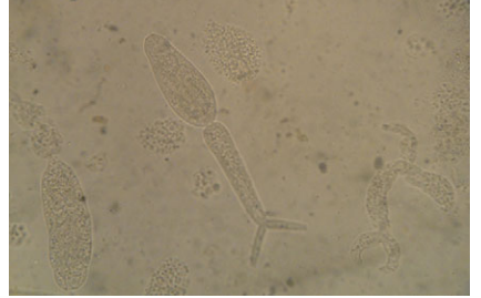
Schistosoma mansoni cercaria.

For such a tiny worm, the schistosome parasite causes a great deal of suffering. Infecting more than 200 million people worldwide and causing liver damage, kidney failure, infertility and cancer, the parasite could be responsible for up to 200,000 deaths annually. 'Some estimates suggest that human schistosomiasis imposes a greater global disease burden than either malaria or tuberculosis', says Susanne Sokolow from Stanford University. Snails carry the parasite and release its larvae into fresh water; the larvae then burrow into the skin of humans contacting the water before migrating through the victim's body and transforming into adult worms, ready to release eggs back into the water to infect the next snail generation. And other factors in the environment could alter schistosome infection rates. Sokolow explains that the exotic Louisiana crayfish may have reduced schistosome infection rates in Egypt by consuming the parasite's intermediate snail hosts. Knowing this, Sokolow wondered whether the parasite could contribute to its own demise. Could the infection alter the snail's behaviour, in a bid to improve the chances of schistosome transmission while inadvertently placing the snail at greater risk?