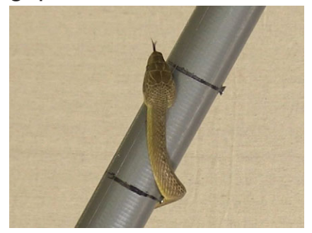
Brown tree snake crawling on the underside of a perch.

To the untrained eye, most snakes look alike, but when Bruce Jayne observes a serpent, he sees many different features. 'Sea snakes have paddle-shaped tails and gliding snakes are vertically flattened,' he explains, adding that many species of tree snake have flattened bellies and sharp ridges running along both belly edges, known as keels. Jayne is also fascinated by how animals interact with their surroundings and is particularly intrigued by how tree snakes stop themselves from slipping on rugged bark surfaces. Reasoning that more rotund species would have problems getting a purchase on rough surfaces, as they would simply roll over bumps and ridges, while flat bellied species may be able to lodge the keel ridge against protrusions and lock themselves in place, Jayne recruited a team of students to test the treeworthiness of three species, ranging from stout boa constrictors to corn snakes and agile brown tree snakes.