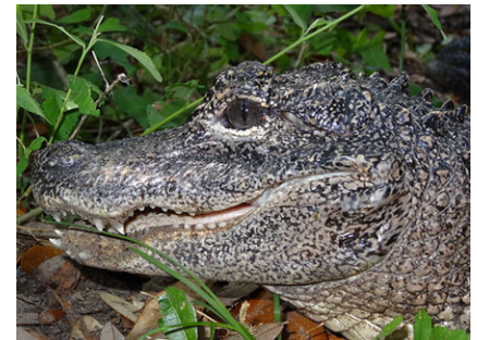
A female Chinese alligator ( Alligator sinensis ).

Once humans master verbal communication, we babble incessantly on any topic under the sun. But even animals that are equipped with less sophisticated communication systems depend on the same resonances that we skilfully shape with our vocal tracts for communication. Stephan Reber from the University of Vienna, Austria, explains that vibrations – produced when air is pushed past the vocal folds – force air trapped in the vocal tract to vibrate (resonate) and it is these resonances that shape bird song and human syllables. Animals also use the frequency of these resonances (how high or low the sound appears) to communicate their body size, with the frequency of a resonance honestly reflecting their size – although some species are known to exaggerate by deepening their resonances. However, no one knew whether reptiles, such as crocodiles and alligators, used resonances to communicate with others. 'Anurans – frogs and toads – do not seem to use them', explains Reber, who decided to find out whether modern day