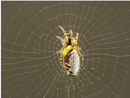
A parasitised spider on an orb web.