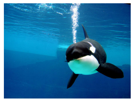
A young male killer whale vocalizing.

If you travel through a country and you have an ear for dialect, you might notice odd words pop up that are particular to the location. Dialects are an occupational hazard of travel, and it turns out that killer whales from different geographical regions have them too. Ann Bowles, from the Hubbs-SeaWorld Research Institute, USA, says, 'Some mammals have a repertoire of calls that seem specific to particular geographic areas or particular social groups.' However, why killer whales acquire their dialect is a mystery and discovering the reason is particularly tricky because killer whales form incredibly stable family groups, making it almost impossible to study dialect acquisition. So Bowles turned her attention to six captive killer whales at SeaWorld San Diego, USA. According to Bowles, five of the animals originated from - or had a mother from - the waters surrounding Iceland, while the sixth was from the Pacific Northwest, and all had arrived in San Diego via different routes. Given the animals' different origins and life experiences, Bowles and her colleagues Jessica Crance and Alan Garver were curious to find out how much overlap there was between the animals' use of dialect (p. 1229).