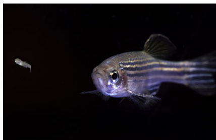
Zebrafish ( Danio rerio ) larva attempting to evade an adult.

If you can’t get out of the way fast when you’re tiny, there’s little hope for your future and even less for your offspring. However, nimble larvae appear to be able to sense approaching doom and take