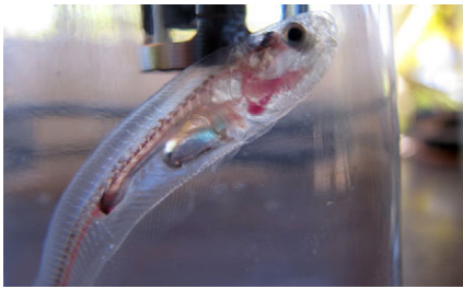
Onuxodon in a respirometer.

The sea is not always as silent as you might think. A great deal of fish chatter goes on beneath the waves on coral reefs. And when you choose to make your home in a clam or pearl shell, acoustic communication becomes even more imperative. Loïc Kéver and colleagues explain that four species of Carapidae take up lodgings in the shells of molluscs and one member of the family, Onuxodon fowleri , makes its home in the shells of black-lip pearl oysters. Explaining that most Carapidae are capable of producing sound by vibrating their swimbladders, Kéver and his colleagues were curious to find out whether Onuxodon could also produce sound and if so, could the sounds be heard beyond the fish's shell homes (p. 4283).