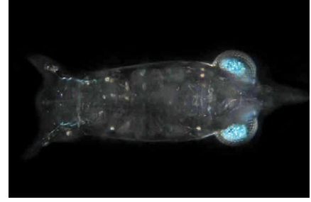
Pseudosquillana thomassini larva with blue ventral eyeshine.

Becoming invisible is probably the ultimate form of camouflage: you don't just blend in, the background shows through you. And this strategy is not as uncommon as you might think. Kathryn Feller, from the University of Maryland Baltimore County, USA, explains that the larval life stages of many marine species are transparent. However, there is one part of the anatomy that most creatures cannot make transparent. Feller explains that the animals with compound eyes have to shield each individual eye unit with an opaque pigment to prevent light leaking between adjacent eye structures. This could blow the larva's cover and poses the question, how do larvae disguise their conspicuous eyes? Many aquatic species use reflectors on scales to reduce their contrast with the background, so when Thomas Cronin told Feller that the eyes of tiny mantis shrimp larvae shone when caught in light, she wondered whether the transparent larvae were hiding their opaque compound eyes behind a reflection (p. 3263).