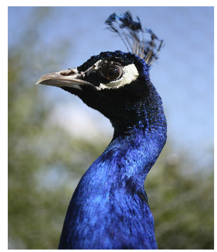
Head of a peacock ( Pavo cristatus ).

Peacocks are in a league of their own when it comes to performing for the ladies, strutting about with their ostentatious fanned trains: what female could resist? Graham Askew from the University of Leeds, UK, explains that males from many branches of the animal kingdom advertise themselves with elaborate ornaments, but these extravagant displays come at a price. 'It is thought that such sexual traits have a negative effect on an individual's performance...but that more elaborate ornaments indicate superior genetic quality', says Askew. In the case of the peacock, he suspected that the train could