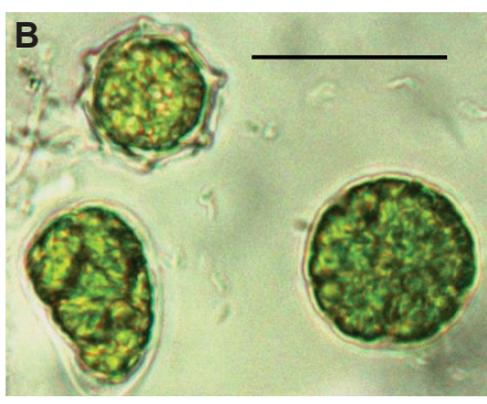
Fig. 1. Characteristics of O. amblystomatis in A. maculatum eggs of embryos in hatchling stages (36–44). (A) Algal cells were significantly more abundant in the inner envelope and vitelline membrane (Mann–Whitney, ** P =0.01), although some remain in the middle and outer egg envelopes. Values are means + s.e.m. ( N =17). Inset shows eggs layers: OE, outer envelope; ME, middle envelope; IE, inner envelope; EB, embryo surrounded by vitelline membrane. (B) Algal cells observed in the inner envelope were predominantly spherical (lower right), but included a few cyst-like (upper left) and ovoid cells (lower left). Scale bar, 10 μm.

previously observed on the inner egg membranes of early-stage embryos and intracellular algae with envelopes (Kerney et al., 2011). It is possible that the cysts observed in our study may represent the cyst morphology of free-living O. amblystomatis that presumably inhabits soils until vernal pools form in the spring and new egg masses are deposited. The O. amblystomatis cysts identified in the present study (Fig. 1B) resemble those of other flagellated green algae including Chlamydomonas and Basichlamys (Nozaki, 2003).