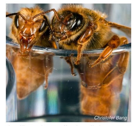
signalling pathways affect juvenile hormone levels in response to diet to turn workers into queens (p. 3977).

Knowing that both pathways are triggered by specific signalling proteins [insulin-like receptor substrate (IRS) and TOR], the team decided to inactivate IRS and TOR individually, and simultaneously, while feeding larvae on a diet of royal jelly. If the signalling pathways were carrying the message that the royal jelly-fed bees should develop into queens, then short circuiting the pathways should force the bees to develop into workers, despite the regal diet.