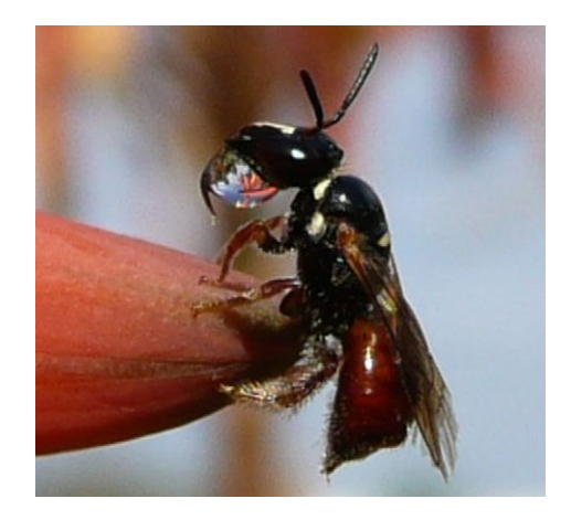
Fig. 1. Female Allodapula variegata concentrating the dilute (14%) nectar of Aloe arborescens by evaporation. The regurgitated droplet, held under the tongue, is repeatedly sucked in and out and may be very large in relation to the size of the bee (body length 7 mm).

1974). The behaviour is not confined to females: laboratory-fed male bumblebees evaporate nectar on their tongues when given 30% instead of 50% sucrose (Bertsch, 1984), and male carpenter bees Xylocopa nigrocinta are fed nectar by females, then dehydrate it at the nest entrance, thus improving the efficiency of territorial flight (Wittmann and Scholz, 1989). Stingless bee males form large congregations outside the nest where they dehydrate nectar on their tongues (Cortopassi-Laurino, 2007). In all these examples, oral elimination of excess water compensates for less than ideal nectar concentrations.