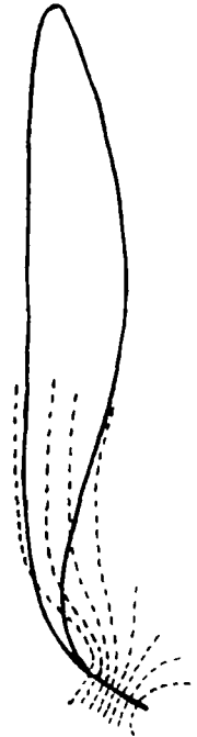
Fig. 3. Diagrammatic representation of the flow of water induced by the caudal fin of a dolphin or fish.

In the case of a rigid body anchored in a stream, the resistance due to turbulent flow is caused by frictional retardation of the flow in the vicinity of the boundary of the body. "If any accelerating or retarding pressure differences exist in the layers of water which adjoin the boundary layer these differences of pressure affect the fluid in the boundary layer also. If the external flow is accelerated by a fall of pressure in the direction of motion the fluid particles which are travelling more slowly in the boundary layer also receive an impulse in the direction of motion, hence all particles continue on their way past the surface of the body" (Ewald, Pöschl and Prandtl, 1930, p. 283). So long as such conditions persist the flow remains laminar and free from turbulence. Owing to the small dimensions of the models described in this paper, it has not been possible to determine by direct observation whether a turbulent flow past the model at rest is replaced by a laminar flow when the model is exhibiting typically propulsive movements, but the evidence suggests that the water in the vicinity of the hind end of the body of a fish or a dolphin is being influenced by such conditions in the external flow as are likely to represent a region or regions of low pressure acting in the direction of motion, and to this extent it seems conceivable that the flow past the surface of an actively moving dolphin is very much less