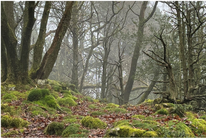
Preservation and restoration of ancient woodland at Great Knott Wood, Lake Windermere.

light levels. Together, these activities will help counteract biodiversity loss and protect these habitats for future generations.