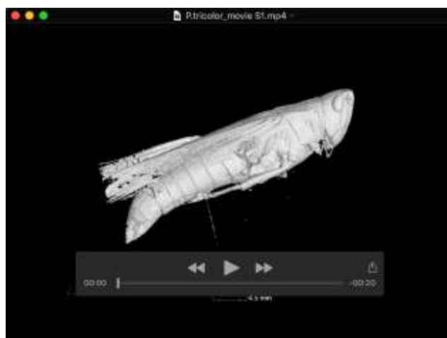
Movie S1. CT scan of respiratory system in P. tricolor .