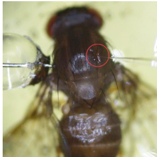
Fig. S1. Photo showing the placement of the electrodes. The reference electrode were inserted directly through the carapace (left) and glass electrode inserted into a flight muscle through a small window in the carapace cut with the tip of a syringe-needle (circled).