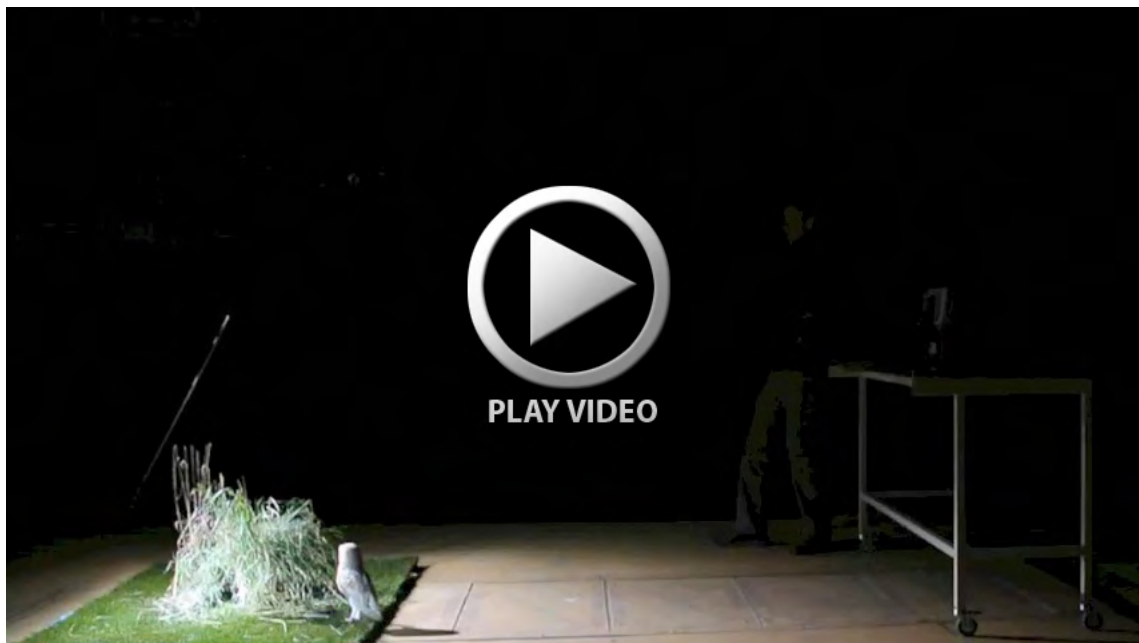
Movie 2. Video and audio of a leap/strike trial. Recorded at 30 frames s^{-1} ; displayed (video and audio) at quarter speed.