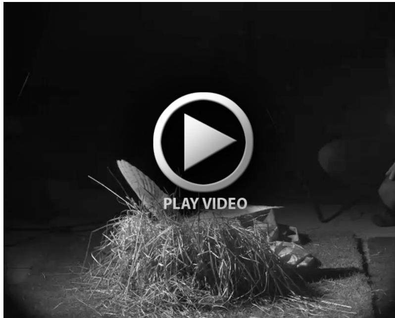
Movie 1. High speed video (no audio) of a complete leap/strike trial. Recorded at 500 frames s^{-1} ; displayed at 24 frames s^{-1} .